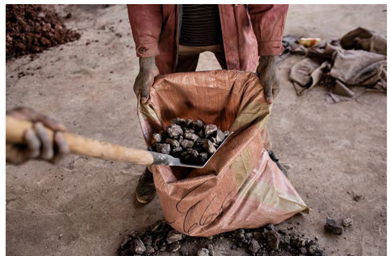
A miner fills a bag with cobalt in Kasulo.

Charging artisanal supply chain actors' exorbitant taxes or fees discourages them from participating in the legal supply chain. If the price for legal production and trade becomes too burdensome, it dissuades legality and therefore participation in any ongoing efforts to establish responsible supply chains.