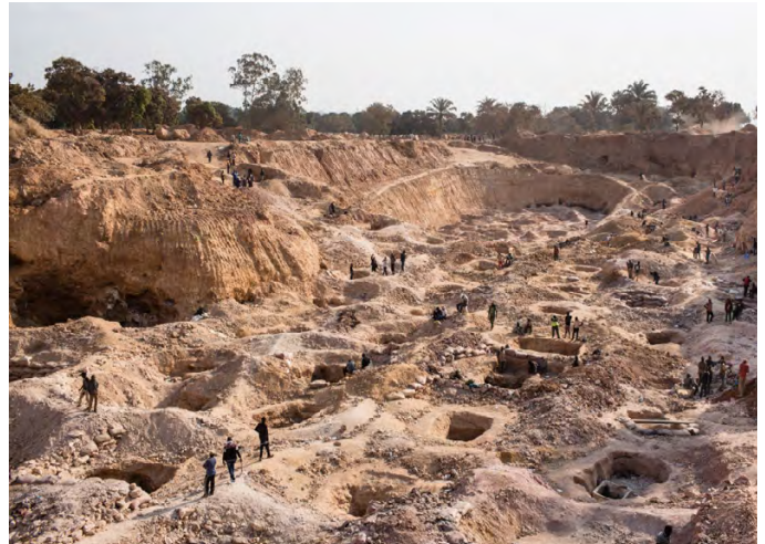
An open pit artisanal cobalt mine in Kasulo.