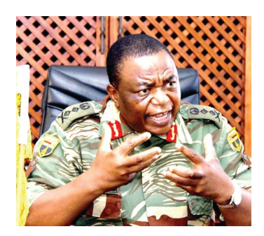
General Constantine Chiwenga, Commander of the Zimbabwe Defence Forces

For example, when he was arrested Klein did not have any paperwork, including KP certificates, RBZ export approvals, or anything that proved whom he had bought the stones from, at what price, and whether taxes had been paid. His passport had no entry stamp, suggesting he had been accorded VIP treatment in circumventing immigration officials upon arrival.