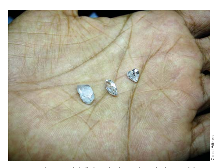
Strong controls are needed all along the diamond supply chain, and the cutting and polishing sector should adhere to KP minimum standards.

An estimated 200,000 carats of rough diamonds are being produced in Venezuela every year. None are being exported legally, and none are being recorded in KP statistics. It is safe to assume that few, if any, are staying in Venezuela. There is good evidence that many of the diamonds are being smuggled out through Brazil, and more significantly through Guyana. Guyanese officials deny the charge, and KP peer review visits of Brazil and Guyana skirted the issue. Neither review team went anywhere near the Venezuelan border where smuggling takes place openly.