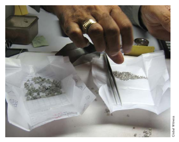
KP participants must strengthen oversight of the diamond industry to curb the illicit trade in rough diamonds.

KP statistics for West Africa reveal worrying trends. In 2005, 2006 and 2007, Sierra Leone reported identical production and export figures. This was also the case for Ghana in 2005 and 2006, and for Liberia in 2007. This trend suggests that authorities have no credible data for national production capacity. Guinea's statistics have exposed large discrepancies with trading partners for over four years running, but the government has not taken steps to reconcile these differences.