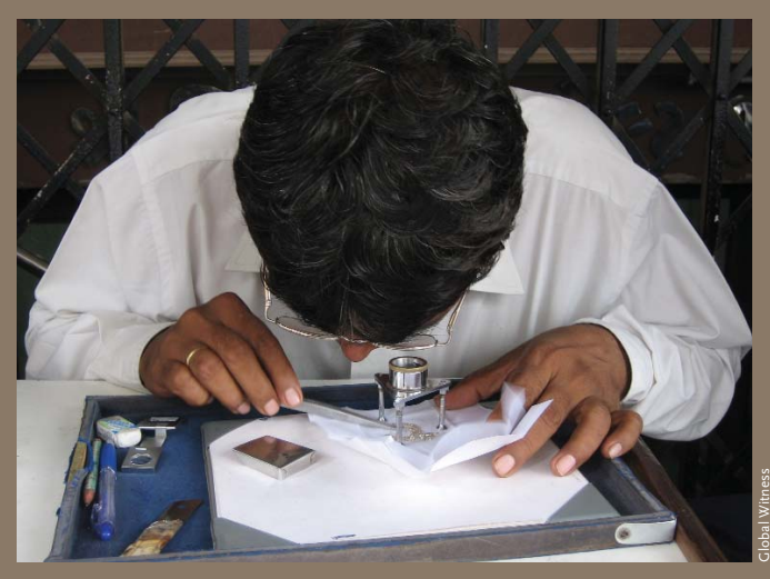
KP participant governments should conduct periodic spot audits of all diamond trading and producing companies operating in their jurisdiction.

In spite of Kimberley Process legislation and controls, there is still an extensive illicit trade in rough diamonds taking place in parallel with the certification scheme. In most cases, government monitoring and oversight of the diamond trade is not effective enough to stop these flows, and enforcement mechanisms designed to halt and prevent the trade in illicit and conflict diamonds are either failing or nonexistent.